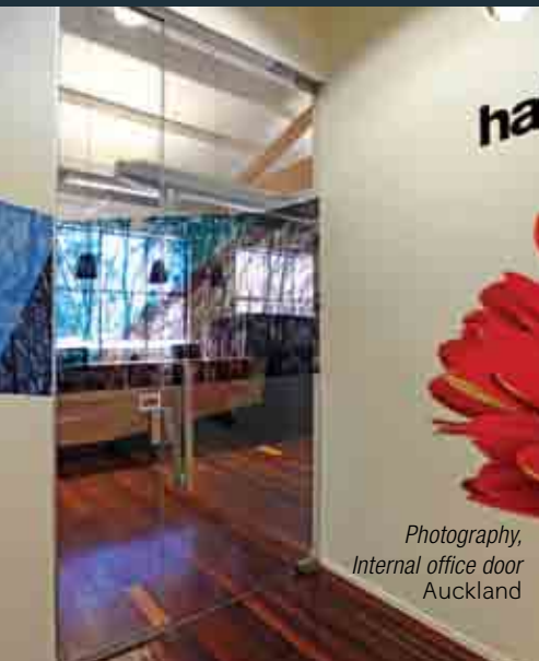
Photography, Internal office door Auckland

Insert media materials include: Fabric, wood veneers, paper and wallpaper, perforated steel, metal mesh, any photo or printed graphic.