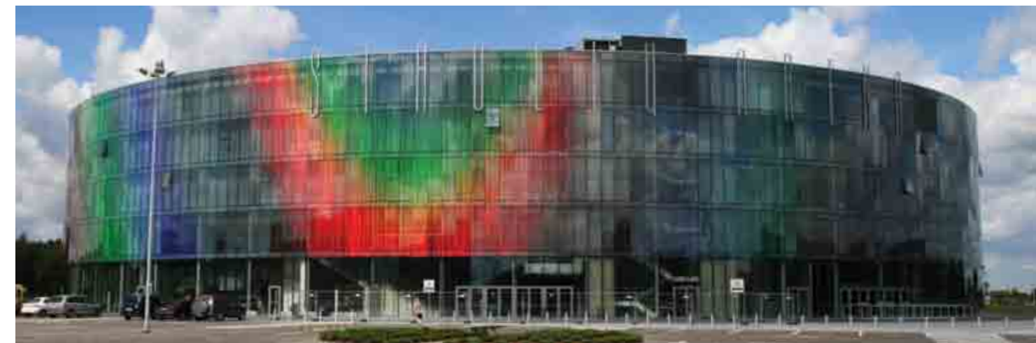
Holographic film, Stadium Europe