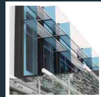
Mixed media, Glass fins - BNZ Bank, Tauranga