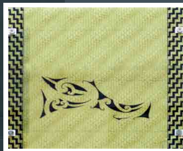
Maori artwork, Internal stairwell - Rotorua Hospital Rotorua

Freestyle by Euroglass™ provides scope for those who see glass as more than just a construction material. We manufacture to the individual requirements and inspirations of our customers. The creative opportunity is limitless and open to a wide range of applications... allow your imagination no boundaries!