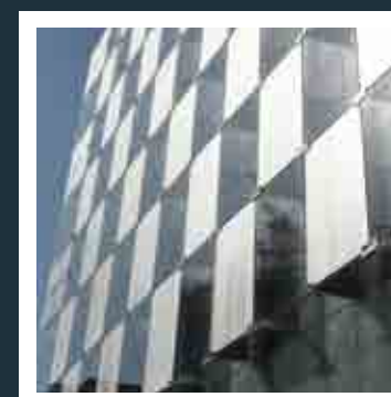
Aluminium mesh external glazing - House of Fashion Spain

25-70%, providing a choice of light transmission. Each of these weaves can be coated with five different metals including Aluminium, Copper, Aluminium/Copper, Chromium, Titanium and Gold.