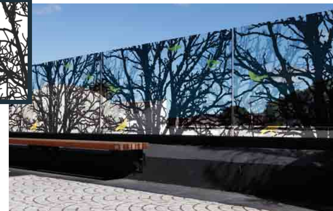
Printed graphic, Car park balustrade Auckland